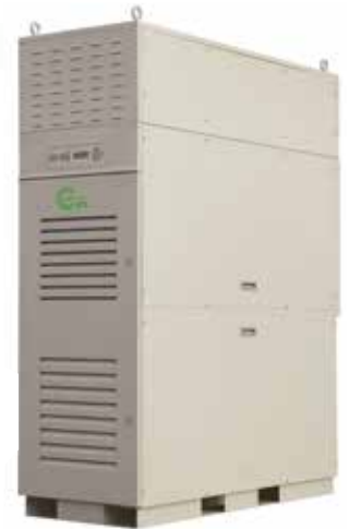
C65 ICHP MicroTurbine